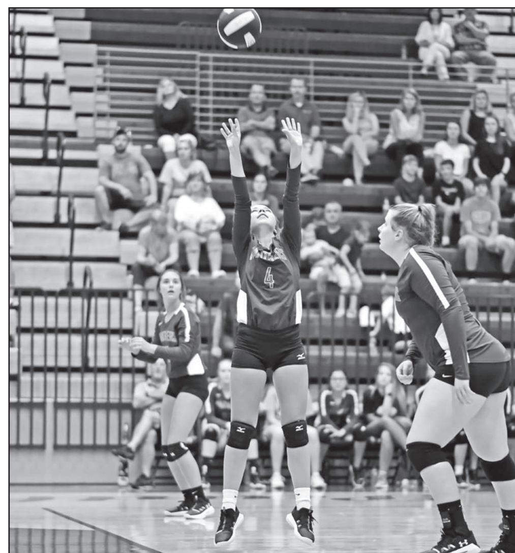
Union County volleyball in action during last Thursday's tri-match.

Tuesday night's matchup with Pickens is scheduled for a 7 p.m. start.